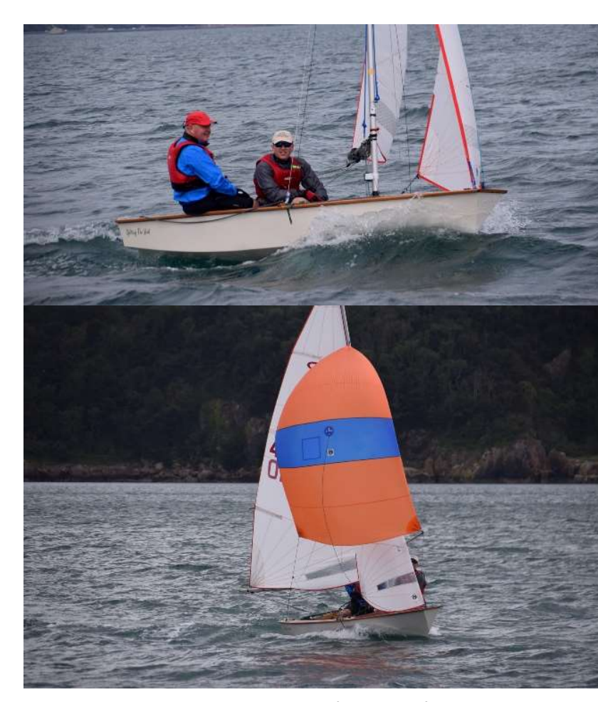
Aug-2023 Nationals at Brixham YC

Miracle 4110 15<sup>th</sup> October 2023